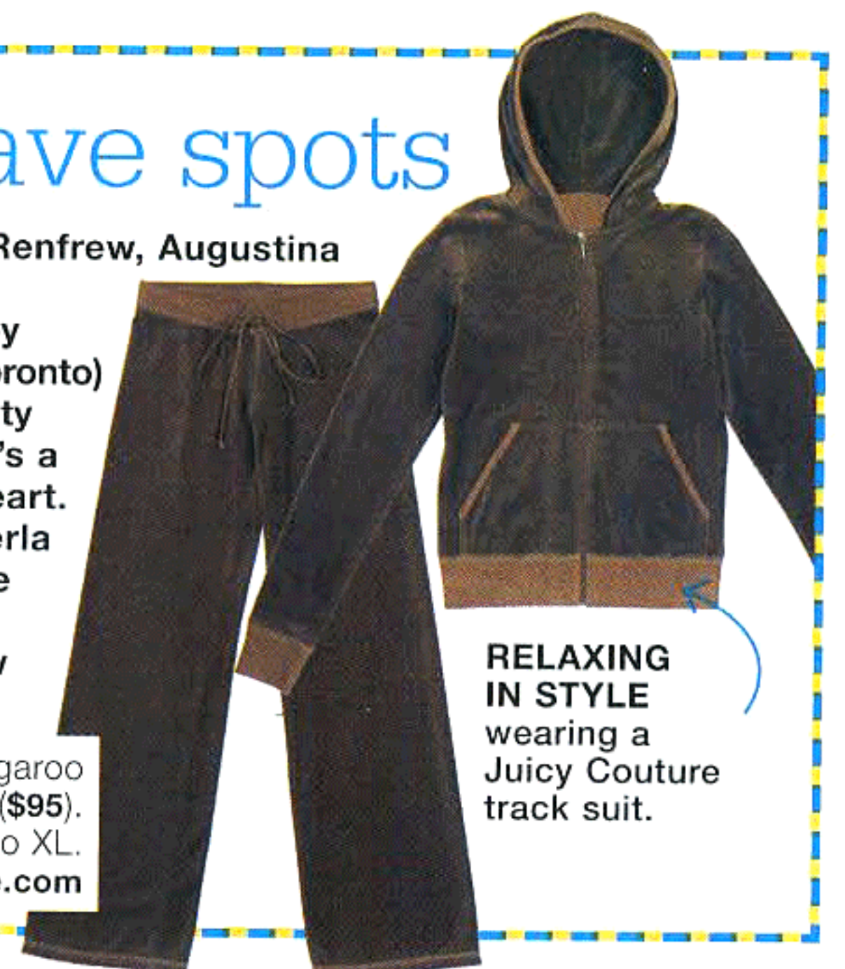
RELAXING IN STYLE wearing a Juicy Couture track suit.

Juicy Couture kangaroo ($120) and pants ($95). Velvet. Sizes XS to XL. juicycouture.com